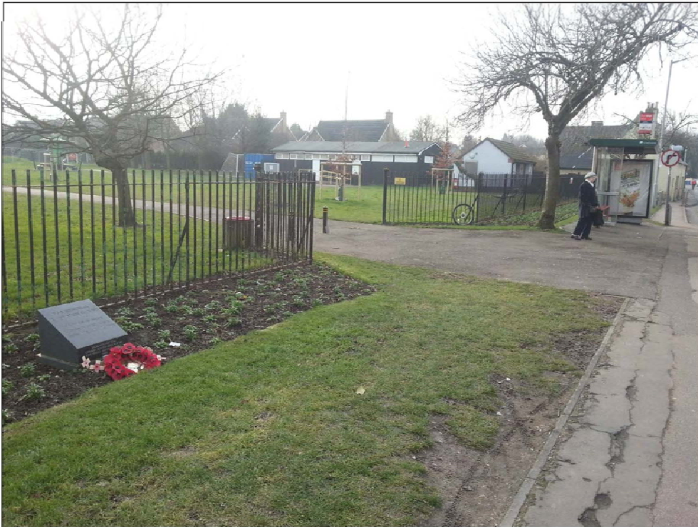
Image 2 - proposed height of memorial plinth